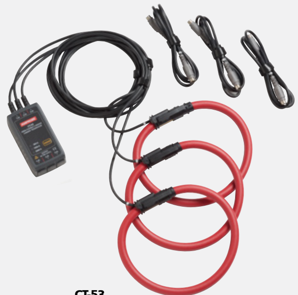
CT-53 Flex Current Sensor

← . . . . High performance processor for accurate, detailed data recordings