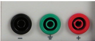
The 9120 series uses 4mm sheathed banana jacks that accept sheathed or shrouded banana plugs and meet the latest international safety standards.