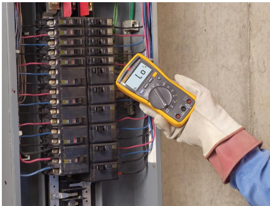
Using the non-contact voltage detector function before making a contact measurement adds an extra layer of safety.

This feature allows technicians to quickly determine whether a panel, cabinet, or machine is properly grounded. If ac voltage is detected, the troubleshooter should then use the Auto-V/LoZ function to determine if the detected voltage is ghost or hard before beginning work.