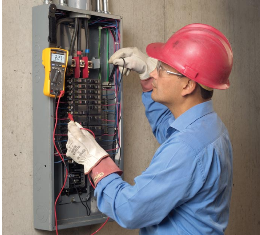
For standard electrical measurements, high impedance meters are preferred, unless ghost voltage is present.

With dual impedance meters, technicians can safely troubleshoot sensitive electronic or control circuits, as well as circuits that may contain ghost