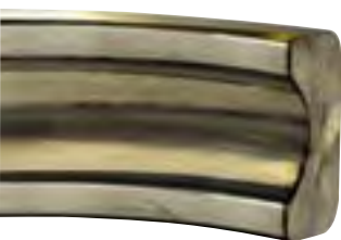
Fluting of a bearing race caused by bearing currents (Photo courtesy of Electro Static Technology).