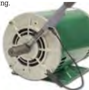
Measuring motor shaft voltage with an Aegis shaft voltage probe (Photo courtesy of Electro Static Technology).

Measuring the voltage of a rapidly spinning motor shaft can be difficult and dangerous. A shaft voltage probe helps to make shaft voltage measurements safer and more convenient by extending your reach, making the electrical connection to a motor shaft by means of a small conductive brush. The reference contact of the probe is connected to ground at the motor housing.