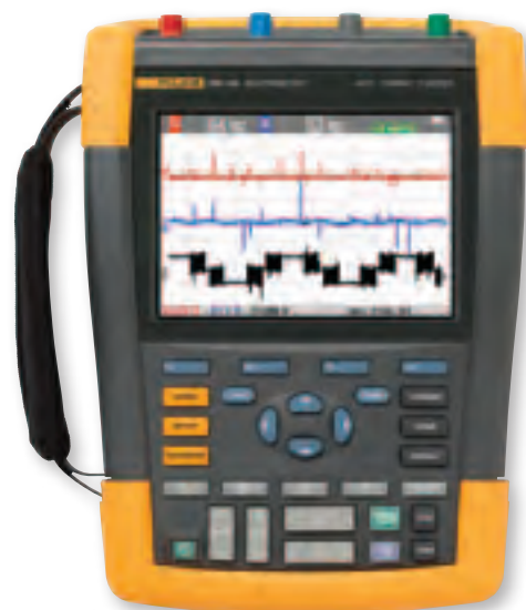
The Fluke 190 Series II ScopeMeter can simultaneously record and display four signals.

Shaft voltage and current spikes caused by the pulse-width-modulated output of motor drives can be exceedingly brief, often in the microsecond measurement range. The high bandwidth (up to 200 MHz) and fast sampling rate (up to 2.5 gigasamples/second) of the Fluke 190 Series II ScopeMeter® make it ideally suited for measuring rapidly changing voltages and