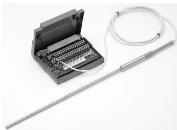
Input connector and probe assembly.