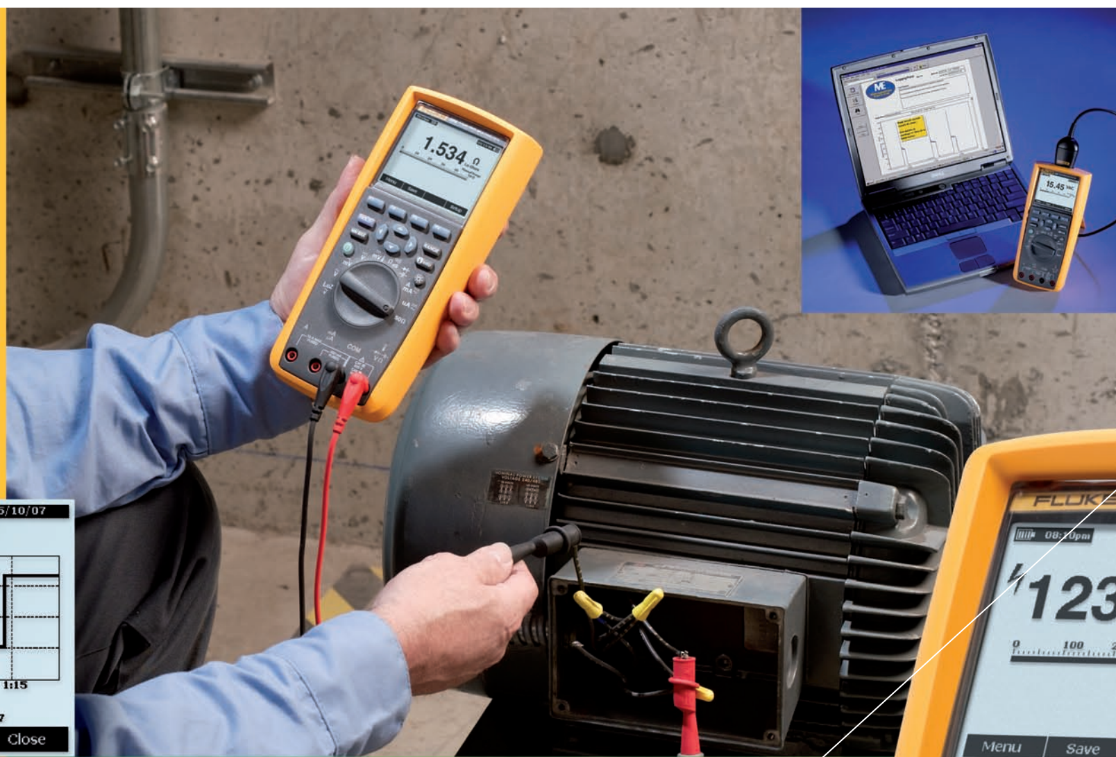
Transfer data to PC using optional cable and FlukeView Forms Software