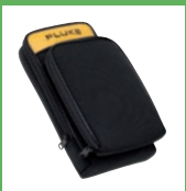
C781 Soft Meter Case