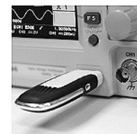
USB Flash Drive